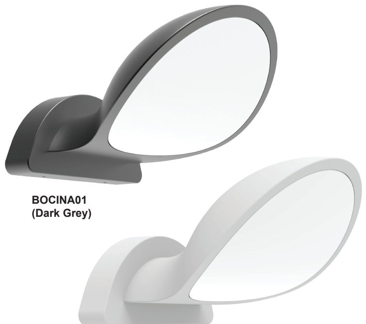
BOCINA01 (Dark Grey)